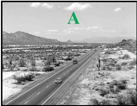
A = Free Flow