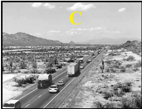
C = Stable Flow