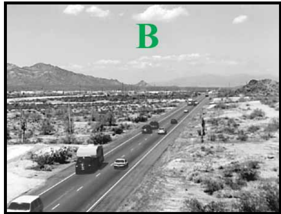
B = Reasonably Free Flow