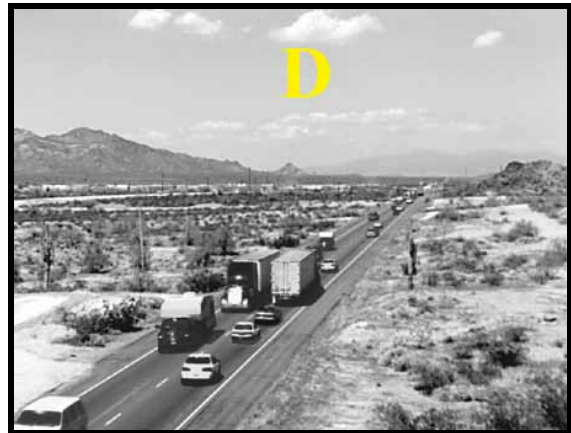
D = Approaching Unstable Flow