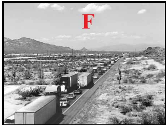
F = Forced or Breakdown Flow